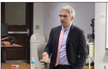
DEPARTMENT NEWS: Bares funds lecture series on careers Page 4