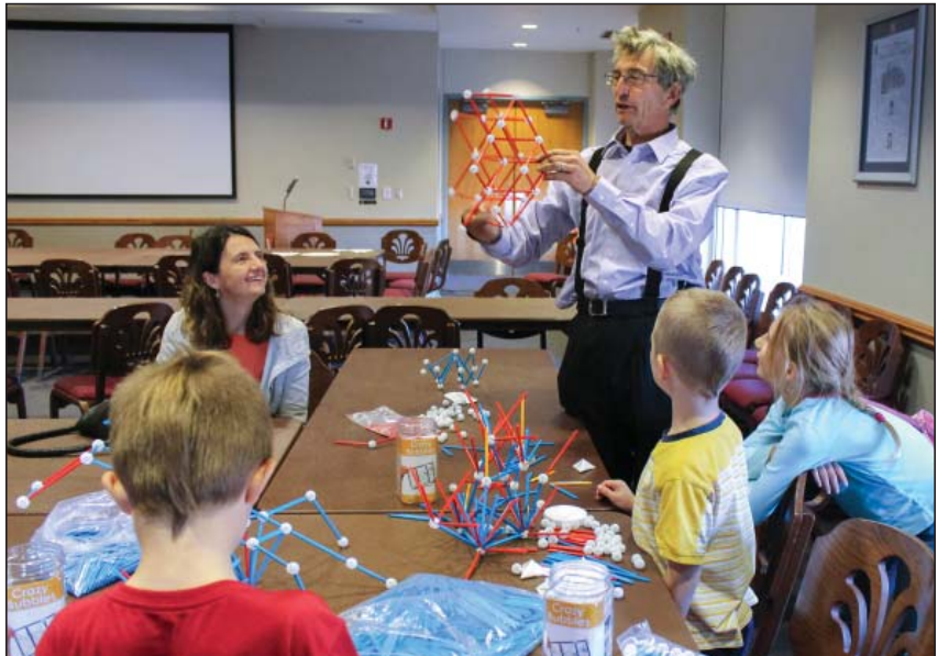
LINDSAY AUGUSTYN/UNL CSMCE